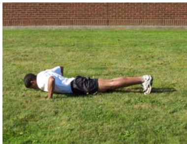
Pushup 'Down' Position

Here are a couple more drills to use once your athletes have mastered the Partner Marching Drills. Again you will be putting their bodies in the right position without them knowing it.