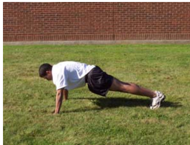
Pushup 'Up' Position